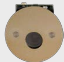
Primer Ready to Paint