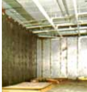
In this second-story, two-vault, Class II installation, the first vault (at left) is complete. Floor and back wall of second vault are under construction.

Your Hamilton professional is an independent businessperson with a vested interest in your community and in making sure you are a satisfied customer. Installation crews and service technicians are always local representatives, friendly and quick to respond. Consult with a Hamilton professional about all your security needs.