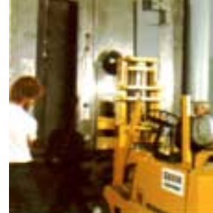
Following completion of the vault itself, technicians install a Hamilton vault door before final finishing operations.