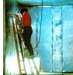
Second vault consists of panels moved from an across-town installation. Panels may be welded or bolted together as required.