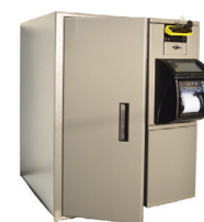
Pictured with optional sidecar