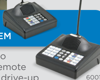
6001-16 16 Channel Console