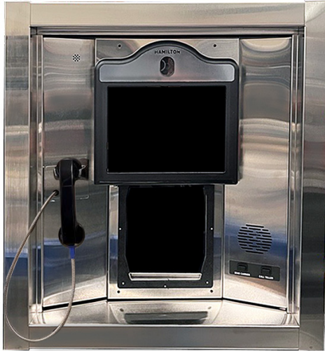
Shown with an Optional Handset

Hamilton's IRT system allows your customers to be serviced from a remote location - whether it's the other side of a wall or several hundred feet away. The IRT makes communication and transfer of cash, coin, paperwork and other small items easy with the inclusion of Hamilton's acclaimed pneumatic tube systems and built-in audio/video components.