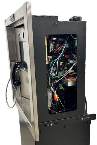
An inside look at the IRT-5000