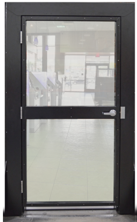
Stainless Steel Upgrade Option Shown